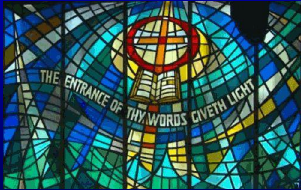
Psalm 119:130, stained glass Shadow Mountain Community Church, El Cajon, CA