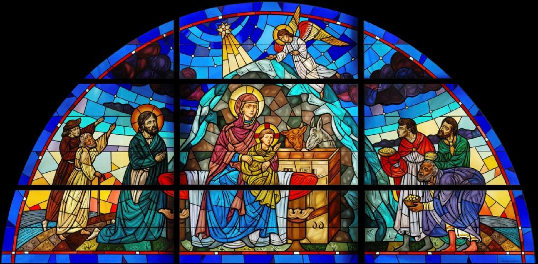
The Nativity, stained glass, St Leon Armenian Cathedral, Burbank CA