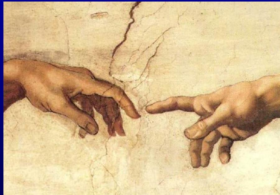
God Giving Life to Adam, Michelangelo, Sistine Chapel, 1511

Since by man came death, by man came also the resurrection of the dead. For as in Adam all die, Even so in Christ shall all be made alive.