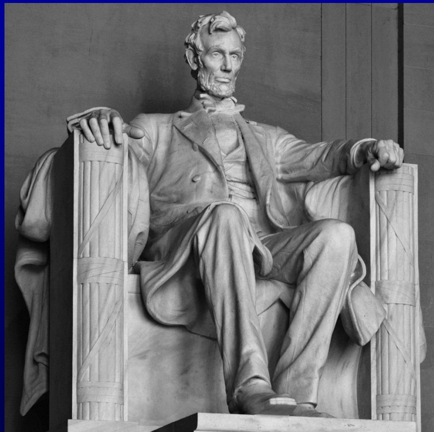
Lincoln Memorial, 1922