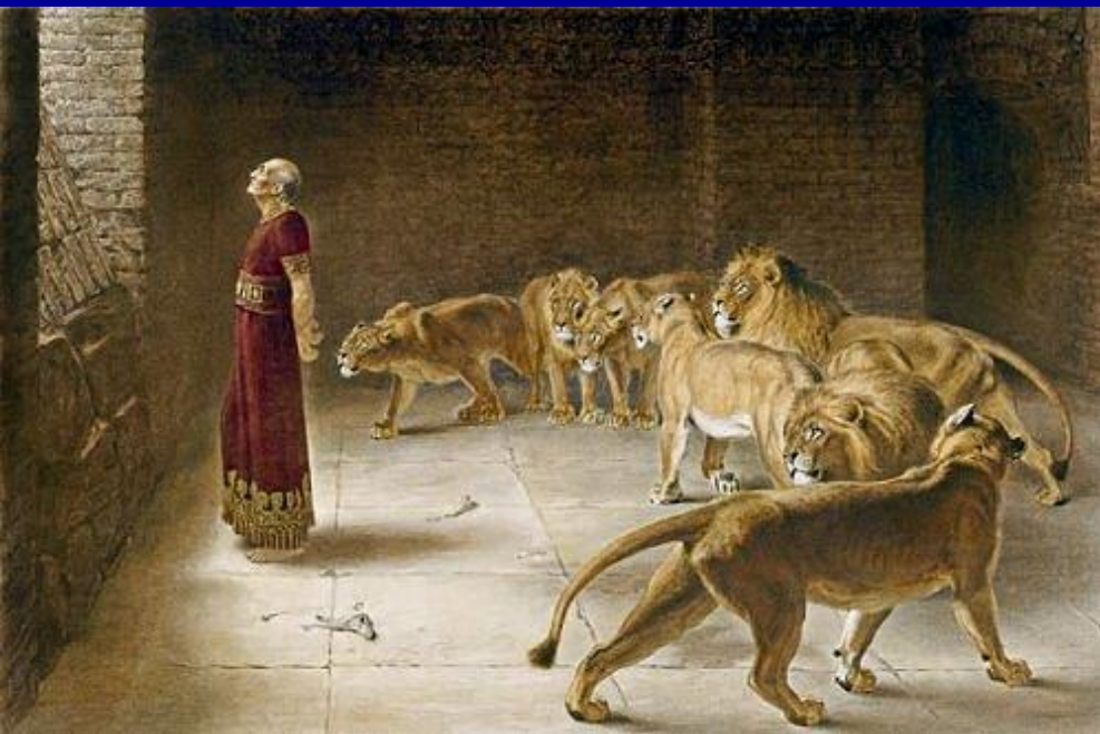
Daniel's Answer to the King Briton Rivière, 1890