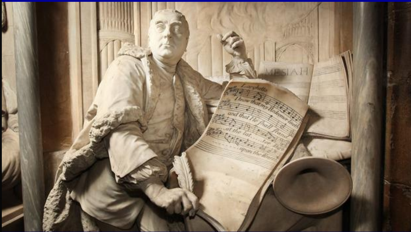
Westminster Abbey, 1761