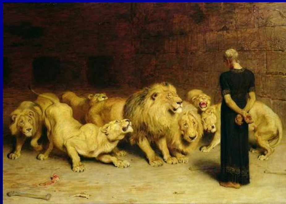
Daniel Briton Rivière, 1872