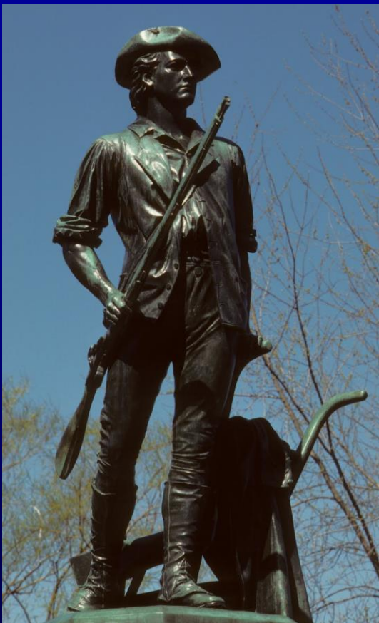
Minute Man, 1876